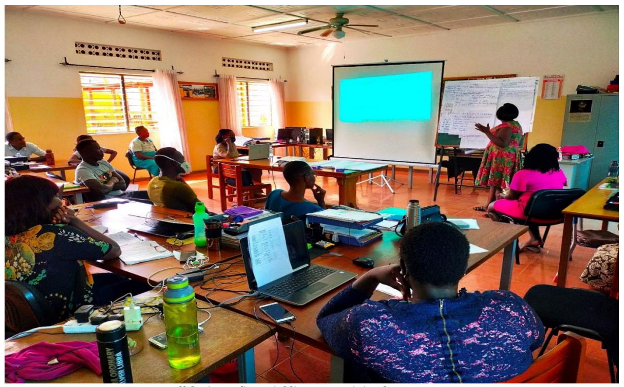
MPI staff during a financial literacy training last year