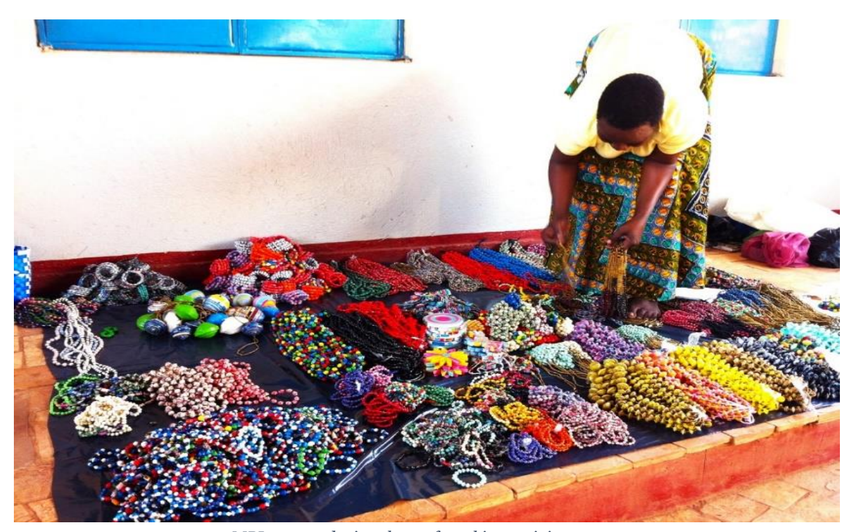
MPI women during the craft making activity