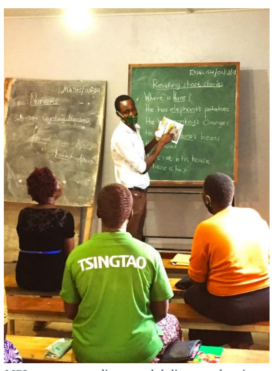
MPI women attending an adult literacy class in Naguru.

All MPI members from young adults to the elderly that did not get a chance to go to school are given an opportunity to acquire basic maths, English speaking, reading, and writing skills. The lessons provided by a qualified teacher twice a week alternating between Kireka and Naguru at the MPI offices in those areas. Acquiring this knowledge improves their esteem and not only allows them to go about their daily activities more confidently but also enables them to access services like banking that would otherwise intimidate them.