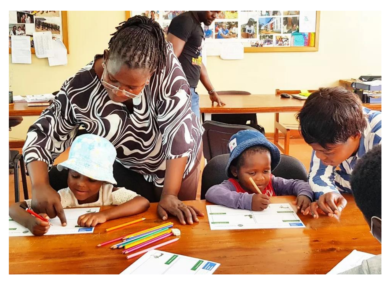
Social workers guiding twins during letter writing to their sponsors

To nurture the relationship, an exchange of letters and photos between the "foster" children and their "parents" is highly encouraged and this happens at least twice a year. Recently, video conferences are sometimes also held between the two and an interpreter is present in case of language barrier instances.