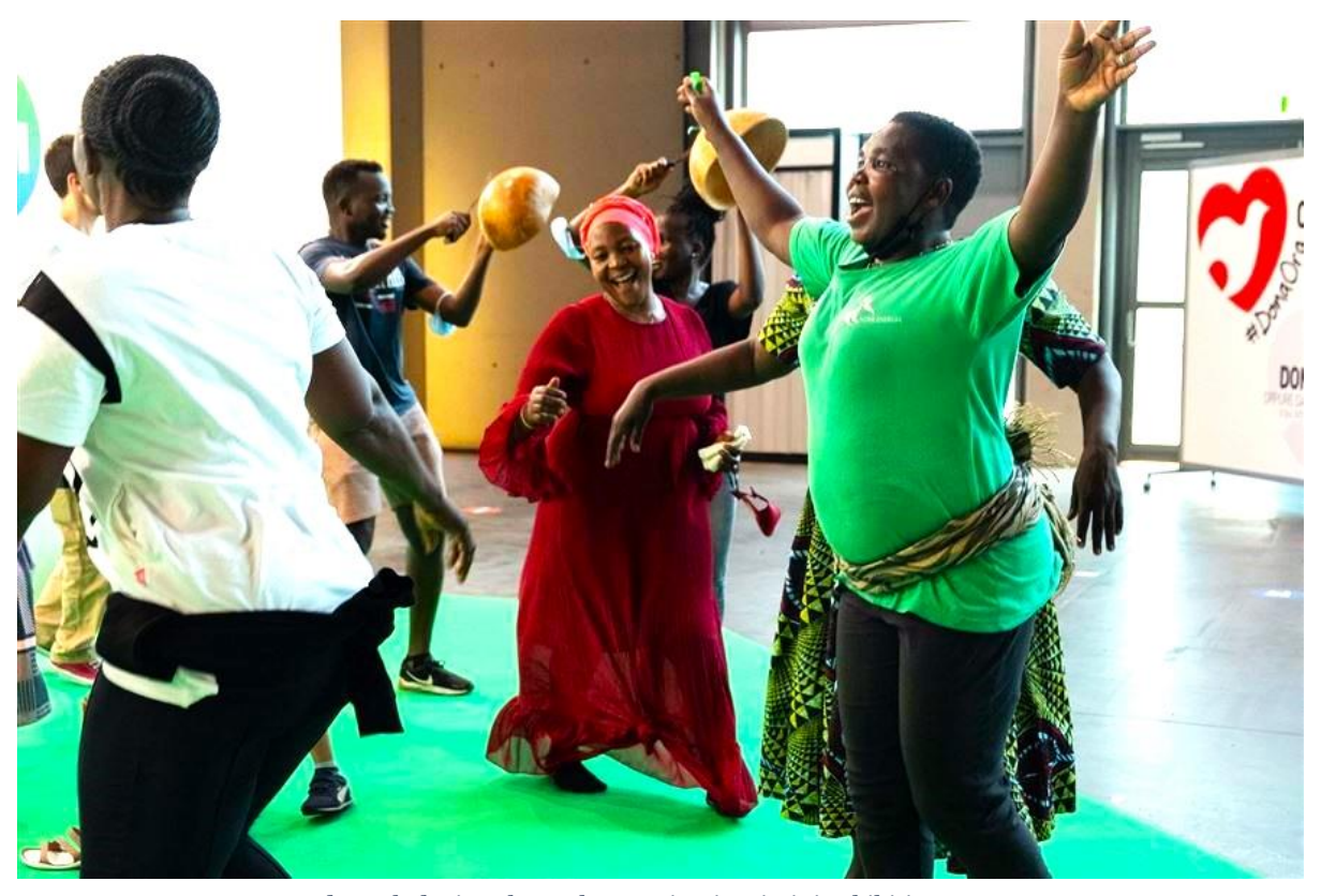
Our women and youth during the at the Meeting in Rimini exhibition

In the late seventies, some friends from Rimini who shared a Christian experience, also discovered they shared a desire to bring to Rimini everything good and beautiful that was present in the culture of those times. They hoped to prompt an encounter among persons of different faiths and cultures and create a place for friendship where peace, socialization, and a friendship among people may be established. These are encounters born from people that share a tension towards what is true, good, and beautiful. Since then every year great political personalities, managers, representatives of different religions and cultures, intellectuals and artists, athletes, and protagonists of the world scene visit it.